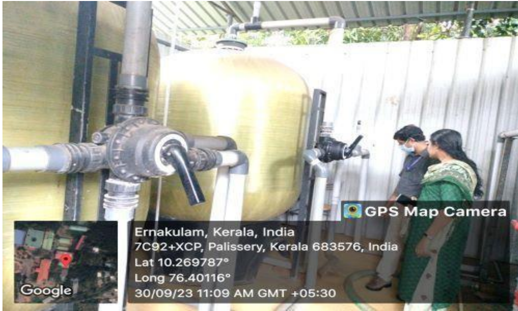
Effluent Treatment Plant

E-Mail: sset@scmsgroup.org Website: www.scmsgroup.org/sset