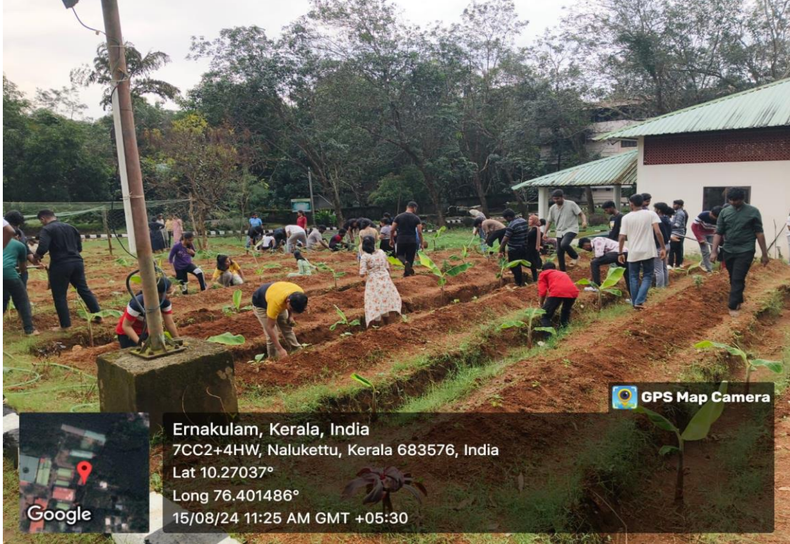
Bio Farming in SSET Campus, August 2024