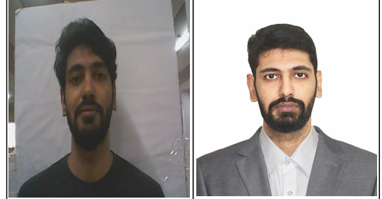
Test Day Photo

170, Thekkekara House, Thavoos lane, Mission Quarters