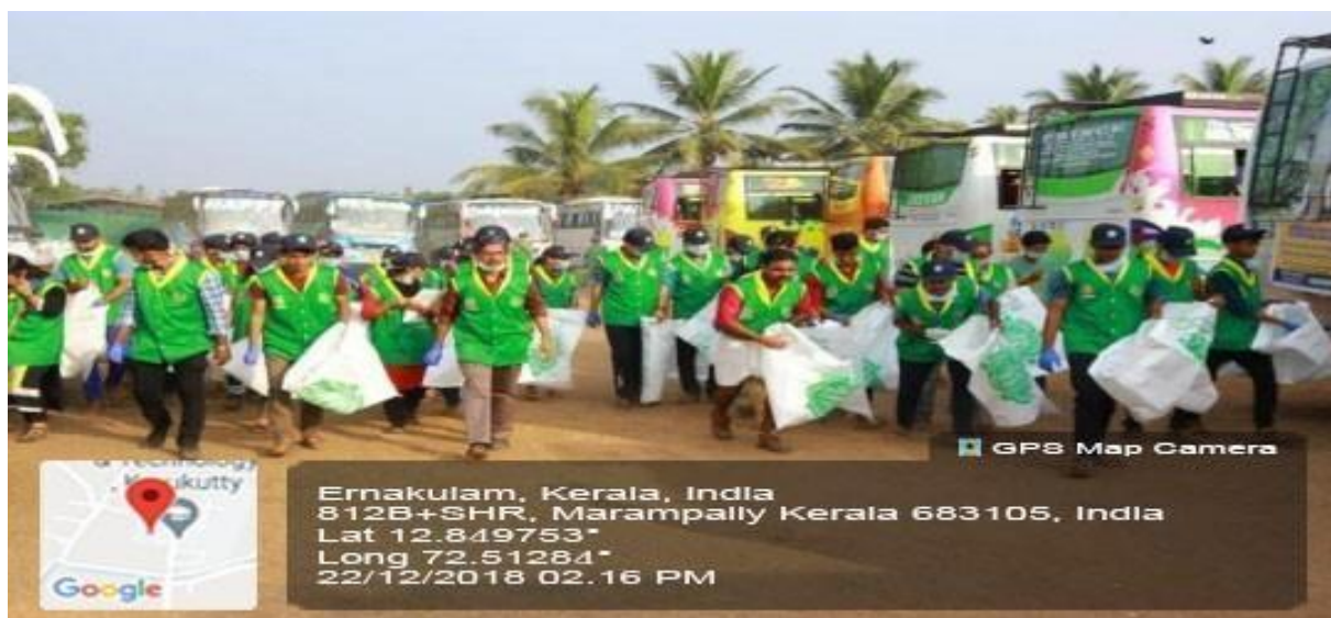
Students Volunteers involved in implementing Green Protocol at Thiruvairanikulam Mahadeva Kshethram