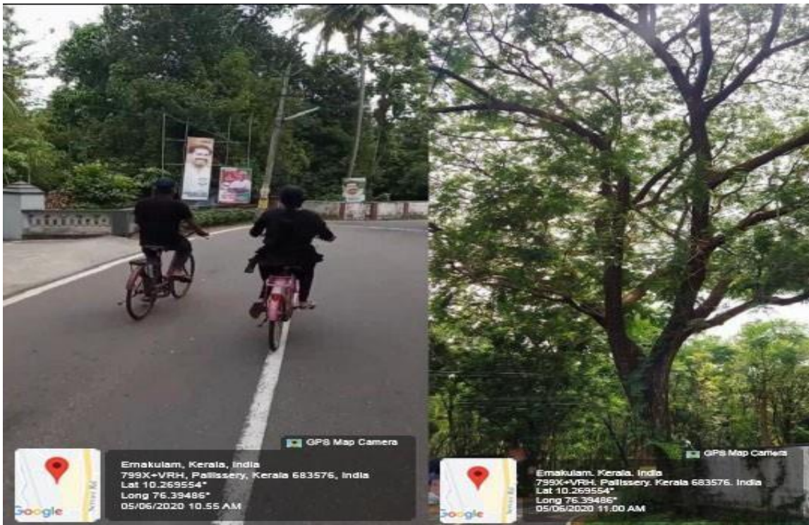
Students in bicycles taking count of roadside trees in the Palissery Stretch

The NSS volunteers of SCMS School of engineering and technology jointly conducted a tree walk to conserve trees on the roadside, prone to deforestation and other man-made practices. An enthusiastic bunch of volunteers started their journey from our college (palissery) to koratty covering 6kms approximately in cycles. While on their way students identified the trees, their biological name, and species assigned to them, and took a count of the trees needed to be protected. Each of those trees will be provided with a nameplate and QR code assigned to them which will be covered in phase 2 of the session that is needed to be conducted.