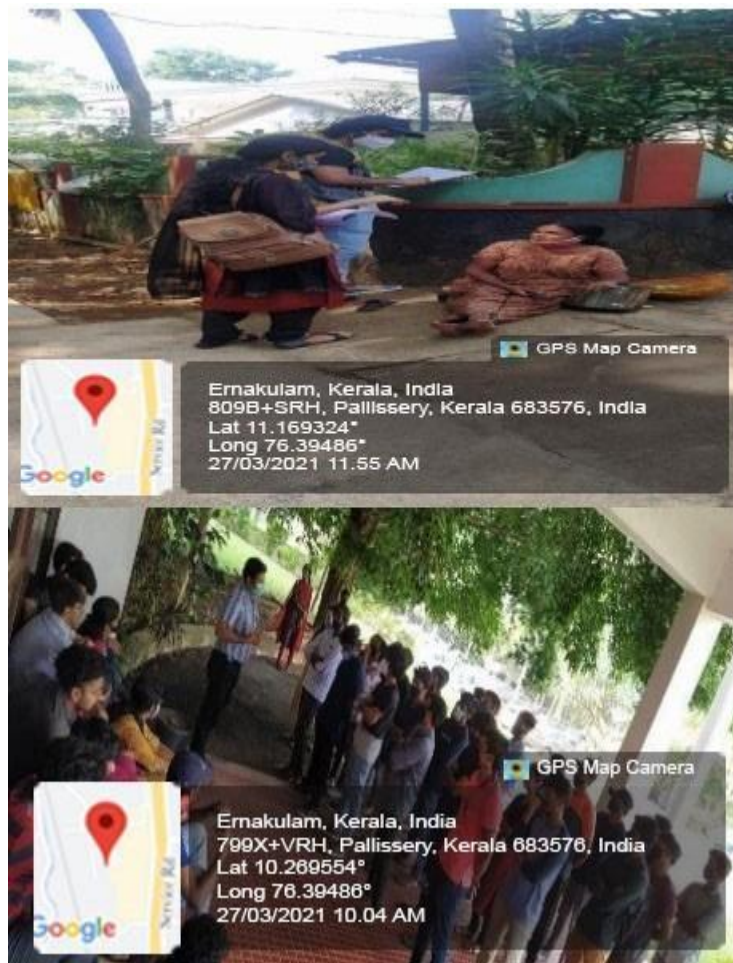
Student Volunteers collecting data from nearby homes, Faculty giving guidance to students regarding data collection

During this time of the covid outbreak, strictly following the covid protocol, NSS volunteers of SSET conducted a survey covering houses under koratty panchayat. Volunteers were divided into groups by our volunteer secretaries, led by an executive panel member and each group was assigned a particular area for the survey. Volunteers were handed over the UBA baseline household survey forms having questions covering the water supply, waste management, inquiries regarding the pension received if any, and so on. Each of these questions in the said form was filled by our volunteers and was collected by our programme officers.