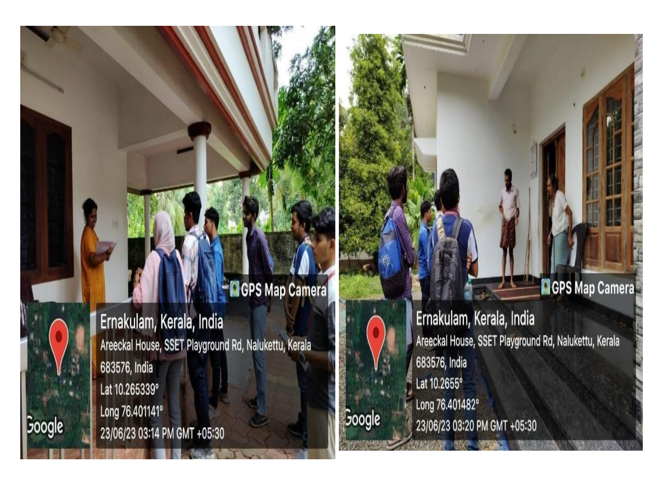
SSET Students involved in Energy audit at Nalukettu Village

VIDYA NAGAR, KARUKUTTY, ERNAKULAM – 683576, PHONE: 0484-2882900, 2450330 E-Mail: sset@scmsgroup.org Website: www.scmsgroup.org/sset