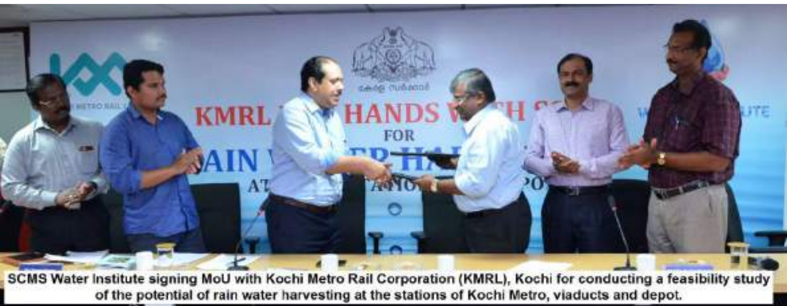
SCMS Water Institute signing MoU with Kochi Metro Rail Corporation (KMRL), Kochi for conducting a feasibility study of the potential of rain water harvesting at the stations of Kochi Metro, viaducts and depot.