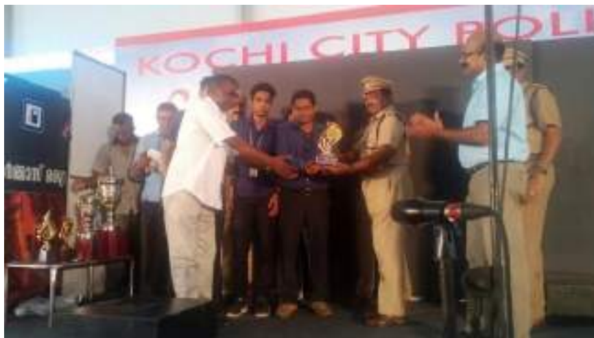
Department of Automobile Engineering selected as best participant for Shubhayathra program, Nov 2017