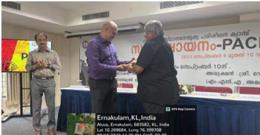
Road Safety Campaign 2023, titled "Surakshayanam," took place on September 10th at SCMS School of Engineering and Technology