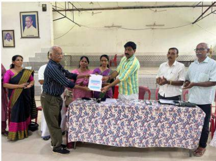
Waste Management Training along with the Haritha Kerala Mission conducted A training program for waste management. 27/08/2023