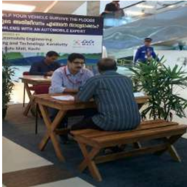
Faculty members of Department of Automobile Engineering at LULU mall as part of One Day Awareness Camp to help your vehicles survive the floods, September 2018

E-Mail: sset@scmsgroup.org Website: www.scmsgroup.org/sset