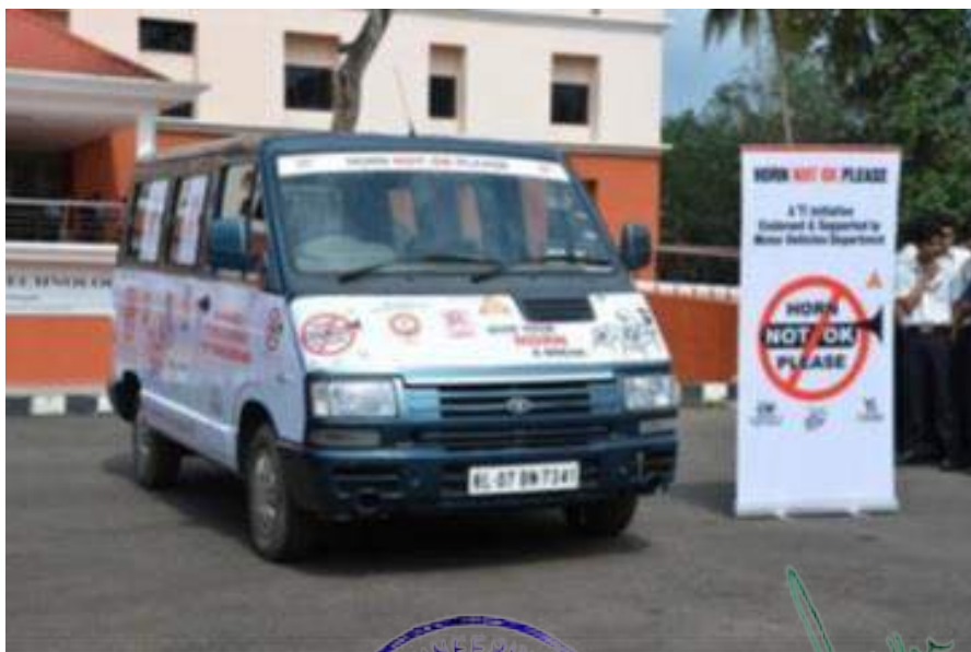
Horn Not OK Please (HNOP) Campaign Vehicle Flag off from SSET Campus