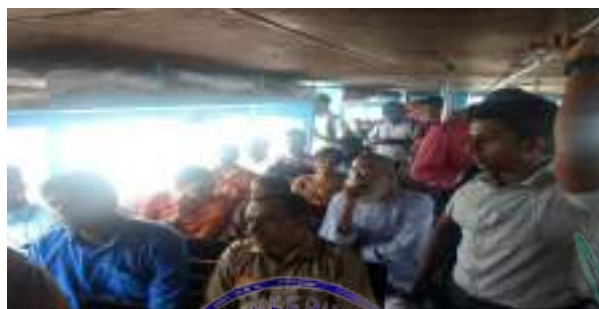
Kochi City Public Transportation Day, July 2018