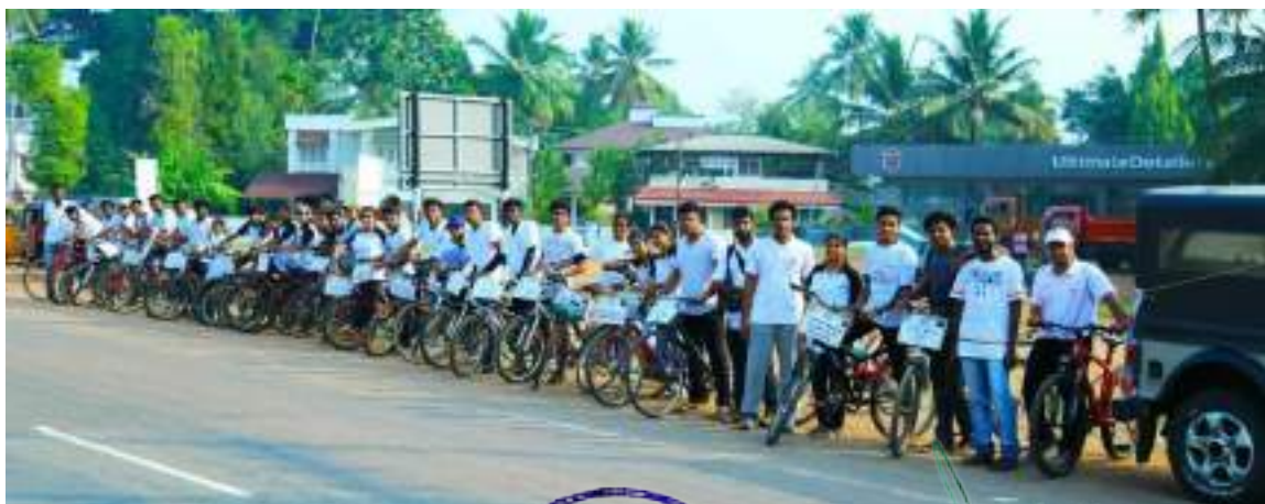
Save a Tree Campaign, March 2018