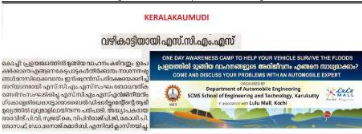
elp your vehicles survive the floods, September 2018