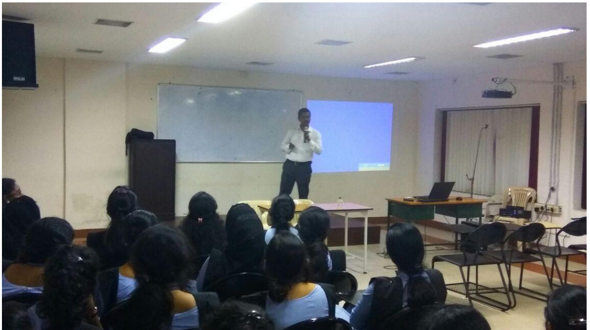
SESSION ON CAMPUS TO CORPORATE BY IBS

On 08 th December 2017, a Session was given for Sixth Semester Students by IBS on the Topic 'Campus to Corporate'. The session handled about various career opportunities available for the students after they step out from the campus. The students were provided with awareness as how to deal with the Corporate Scenario.