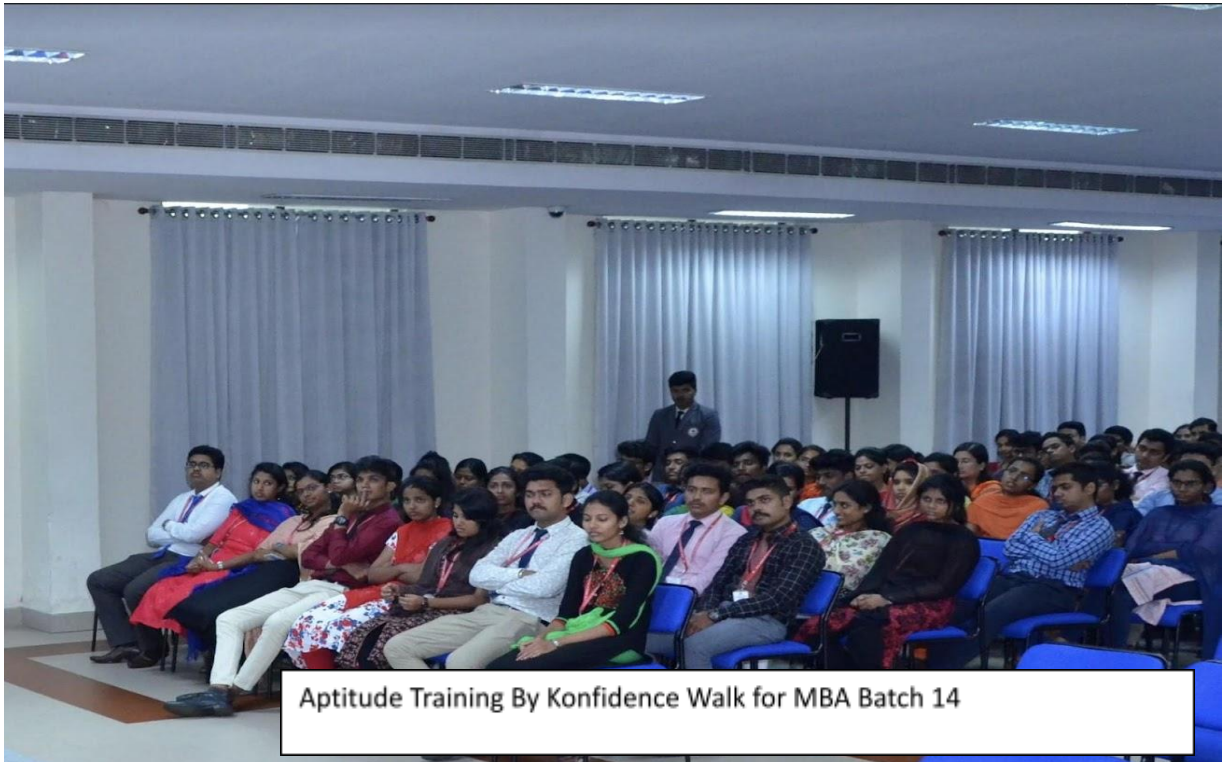
Aptitude Training By Konfidence Walk for MBA Batch 14