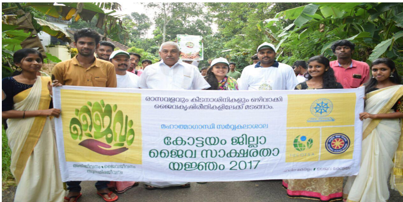
An awareness rally was conducted on 4th September 2017 as a part of “Kottayam District organic literacy campaign”

Report: An organic literacy campaign is an educational initiative that aims to raise awareness and promote the benefits of organic farming and consumption. The primary objective of the organic literacy campaign organized by the college was to promote organic farming practices and encourage the consumption of organic products. The campaign aimed to raise awareness among the residents of Vijayapuram panchayath, Ernakulam district. The organic literacy campaign organized by the college was successful in achieving its objectives of promoting organic farming practices and encouraging the consumption of organic products. The various activities and events organized by the college helped to raise awareness among the students, faculty, and residents of Vijayapuram panchayath about the benefits of organic farming and the harmful effects of conventional farming practices on the environment. The campaign was a significant step towards promoting sustainable agriculture and a healthier environment.