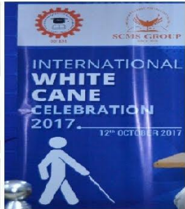
Mathrubhumi Newspaper Report Tue, 17 October 2017 digitalpaper.mathrubhumi.com/c/22991709