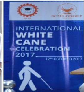
Mathrubhumi Newspaper Report Tue, 17 October 2017 digitalpaper.mathrubhumi.com/c/22991709

Mathrubhumi Newspaper report on White cane day on 17/10/2017 Event: International White Cane Day Celebrations News paper report Heading: White Cane Day Celebrations