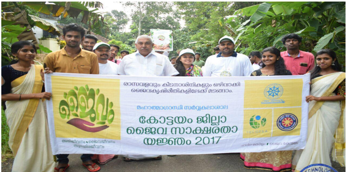
An awareness rally was conducted on 4th September 2017 as a part of “Kottayam District organic literacy campaign”

Report: An organic literacy campaign is an educational initiative that aims to raise awareness and promote the benefits of organic farming and consumption. The primary objective of the organic literacy campaign organized by the college was to promote organic farming practices and encourage the consumption of organic products. The campaign aimed to raise awareness among the residents of Vijayapuram panchayath, Ernakulam district. The organic literacy campaign organized by the college was successful in achieving its objectives of promoting organic farming practices and encouraging the consumption of organic products. The various activities and events organized by the college helped to raise awareness among the students, faculty, and residents of Vijayapuram panchayath about the benefits of organic farming and the harmful effects of conventional farming practices on the environment. The campaign was a significant step towards promoting sustainable agriculture and a healthier environment.