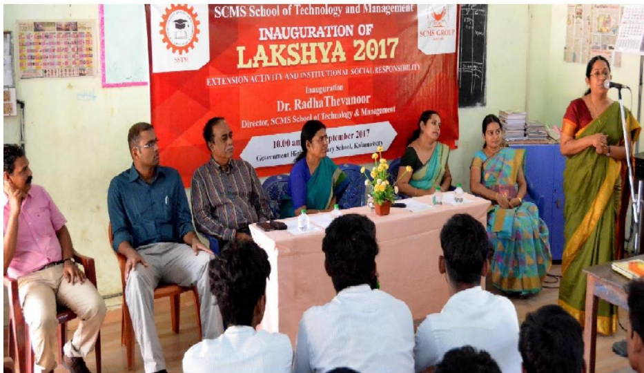
As part of Extension activity and Institutional Social Responsibility, SSTM is extending a helping hand to Kalamassery Government School by conducting an enrichment PROGRAM IN EXCEL AND TALLY for the higher secondary school students under the banner LAKSHYA 2017.