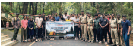
NSS Nature Study Camp at Vazhachal Forest Division.

A two-day ‘Nature Study Camp’, was organized for NSS volunteers of unit numbers 130 and 260 of SCMS School of Technology and Management at Vazhachal Forest on January 4 & 5, 2024.