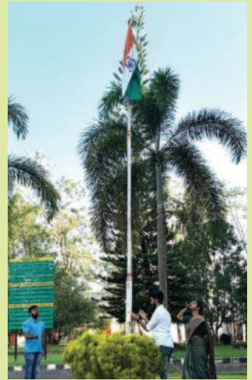
The flag unfurling ceremony was held in the various SCMS Group of Institutions on January 26, 2024, to commemorate and celebrate India's 75 th Republic Day. Heads of Institutions unfurled the flag in the different campuses.