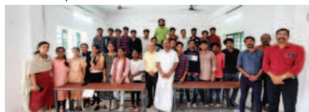
NSS Annual Special Camp