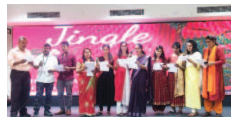
Carol song by SSET 'singers'

The members of SSET celebrated Christmas on December 22, 2023. Each department showcased its talents in music, dance, and skits, adding a personalized touch to the celebration.