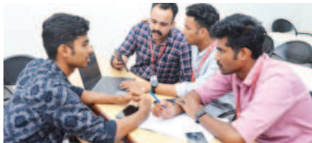
Students of MBA in Zero Waste Hackathon.

The Innovation and Entrepreneurship Development Center (IEDC) at SSTM organized a Zero Waste Hackathon on December 8, 2023. The event brought together bright minds, eager to brainstorm and develop innovative ideas to tackle the growing global concern of waste management.