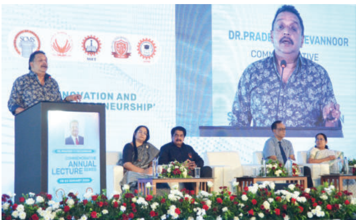
Mr. Shibu Baby John, delivering the Keynote Address in the Dr. P.P.T. Commemorative Annual Lecture.