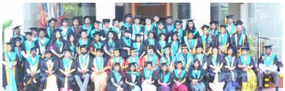
Graduated PGDM students with chief guests and members of faculty.