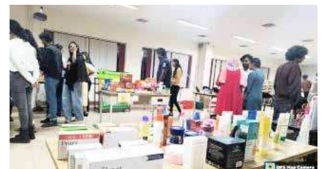
simulated retail store named "BB Stores"

The BBA Department organised a simulated retail store named "BB Stores" on March 22, 2024, an educational initiative aimed at providing hands-on experience in retail management. The store showcased a wide array of products and arranged various categories such as household goods, stationary items and personal care items etc.