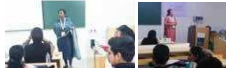
International Conference on Recent Advances (ICREFMT 2024),