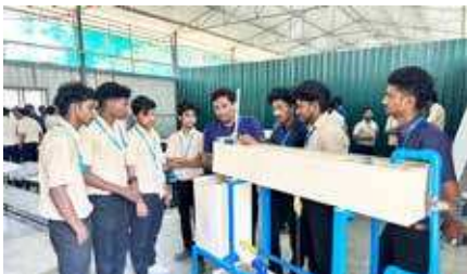
Project Demonstration by Final year Mechanical Engineering students.

The Department of Mechanical Engineering conducted a Live Project Demonstration by Final year Mechanical Engineering students for first year and second year students on March 21, 2024. Thursday. The session was useful for all the students.