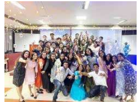
Director's Fireside-Farewell Party for PGDM Batch 31

Director's Fireside-Farewell Party for PGDM Batch 31 was organised on March 27, 2024, at Seminar Hall.