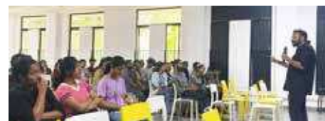
Workshop on Thesis Preparation: Guiding Students towards Success