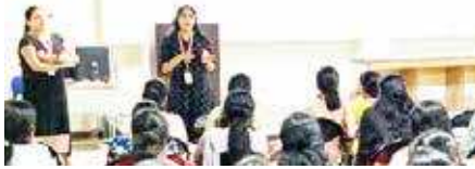
A session on menstrual cup awareness.