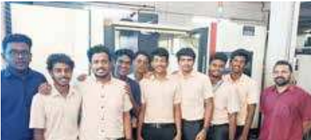
Students participating in the industrial training in CNC Machine

The Department of Mechanical Engineering conducted an industrial training in CNC Machine for Sixth Semester Mechanical Engineering students at Primus Die and Moulds, Kodanad on March 22 to 23, 2024.