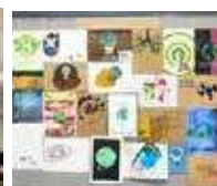
Posters, designed by the students.