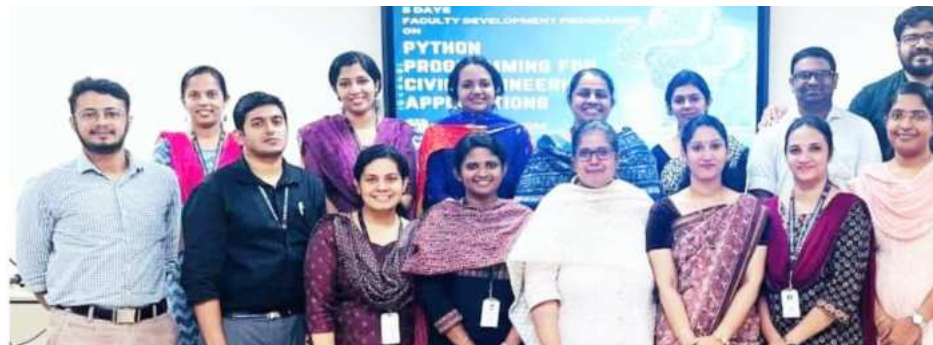
Faculty of the Civil Engineering Department for the Session on Python programming