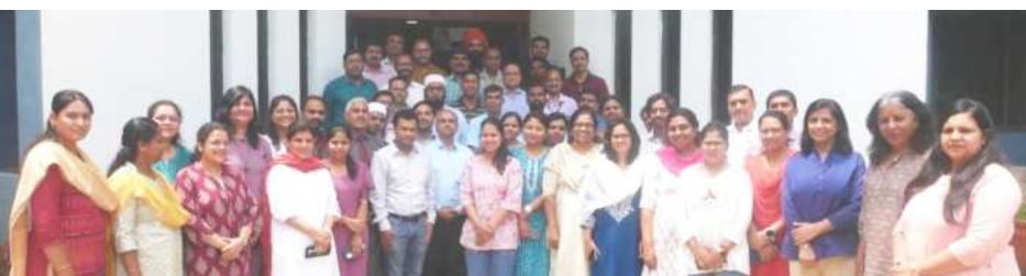
Attendees of Master Trainer Program on High-Performance Computing

“Automated Form Filling Using OCR and Machine Learning for Enhanced Data Accuracy and Efficiency” in the “International Journal of Research in the Academic World” on June 20, 2024.