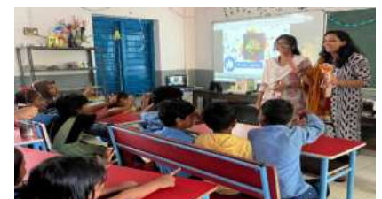
Good Touch and Bad Touch awareness Program.