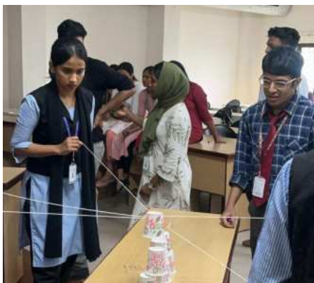
Leadership Development Program organized by the Department of HR.

The Leadership Development Program organized by the Department of HR, was conducted on March 4 and 5, 2024. The two-day program saw enthusiastic participation from a diverse group of undergraduate students. The students from BBA, BCA, B.Sc. Biotechnology, and B.Sc. Psychology, immersed themselves in activities, aimed at honing their communication, crisis management, and teamwork skills.