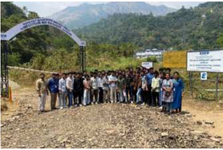
Industrial visit to the Pallivasal Hydro Electric Power Station.

According to the academic curriculum, an Industrial Visit has been arranged by the Association of Innovative Mechanical Engineers (AIME) for S2-ME & S5-ME students (42 individuals), along with three faculty members and one lab staff, to visit the Pallivasal Hydro Electric Power Station on Monday, March 4, 2024.