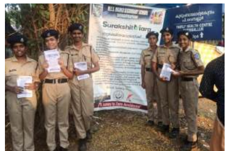
Road Safety Awareness Program at Vemballur Ambala Nata Vazhoor temple premises, led by MES HSS Road Safety Club & SPC under SurakshitMarg.