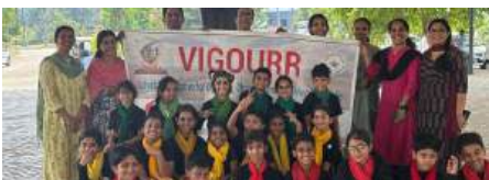
Vidyodaya School, Thevakkal students after their road safety awareness street play at SSTM.