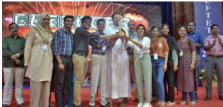
SSET Team receiving the Overall Champion trophy of LUFTETAR

SSET emerged as the Overall Champions, in LUFTETAR 2025, a prestigious national-level inter-collegiate fest, which was held on January 16 and 17, 2025. Students from SCMS School of Engineering and Technology (SSET) actively participated in a range of events, showcasing their talents and competitive spirit.