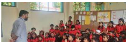
Road safety awareness session at St. Mary's LP School, Koratty, organized by PSHSS Thirumudikkunnu under SurakshitMarg.