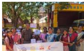
Road Safety Awareness Rally