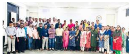
Workshop on IPR and Patent Filing

The Research Cell and the Department of Mechanical Engineering at SCMS School of Engineering and Technology (SSET), in collaboration with the Intellectual Property Rights Information Centre (IPRIC-K), KSCSTE, IQAC, IEDC, IPRC, and IIC, successfully conducted a one-day workshop on “Intellectual Property Rights & Patent Filing” on June 27, 2025. The event was supported by the Kerala State Council for Science, Technology and Environment (KSCSTE). The workshop was designed to create awareness among students, faculty, and innovators about the significance of Intellectual Property Rights (IPR), the patent filing process, and legal frameworks surrounding innovation.