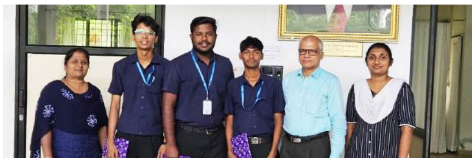
Reading Day competition winners with the prize.