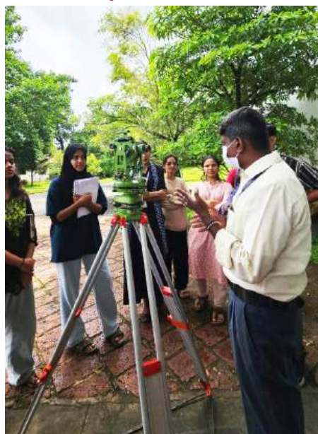
Students using survey instruments

The Department of Architecture conducted a hands-on Workshop on Surveying and Levelling for 6th-semester students on June 13, 2025. Aimed at bridging design theory with real-world application students were introduced to key surveying tools—such as theodolites, dumpy levels, and total stations—and trained in measuring contours, boundaries, and elevations under expert guidance.