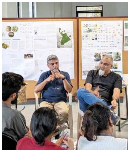
Jurors at the session

The Mid-Semester Jury, held on May 26 and 27, marked a key academic milestone for final-year B.Arch. students, offering a platform to present and refine their thesis projects. Guided by distinguished external jurors—renowned practicing architects—the session provided valuable professional feedback and critique.